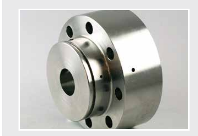
Ability to cater for small one-off requirements to large orders of complex components.