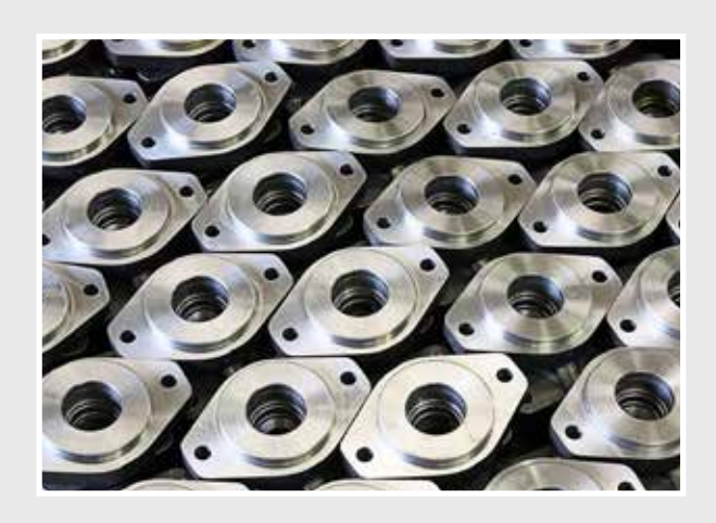
Advanced technology, machinery and tooling for high volume production runs.