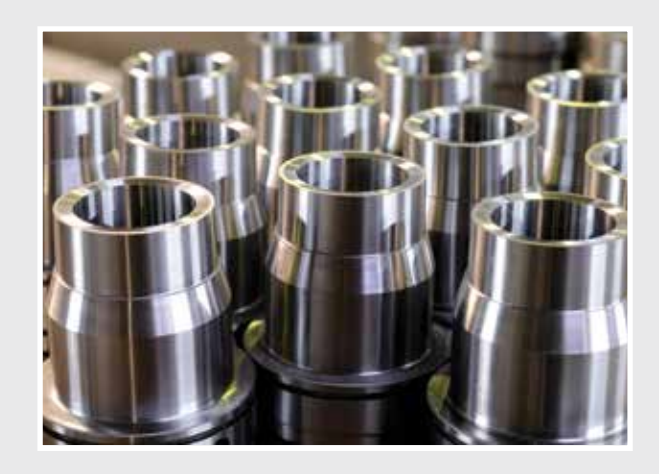
Ability to produce components from a variety of materials including aluminium, brass, bronze, copper, duplex, plastics and numerous steels.