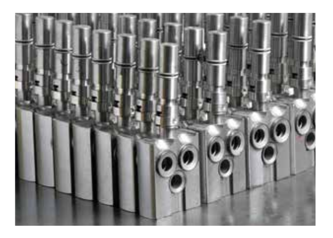
In-house design and manufacturing team combined with expert tradesmen allows for customised innovative solutions.