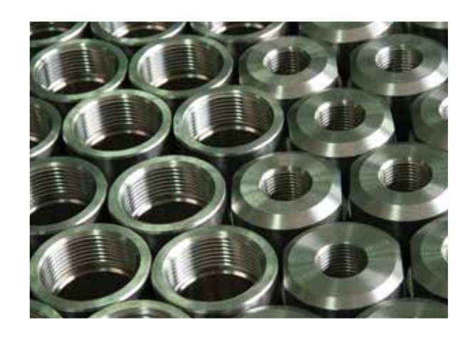
State-of-the-art machinery for component accuracy, first time, every time.